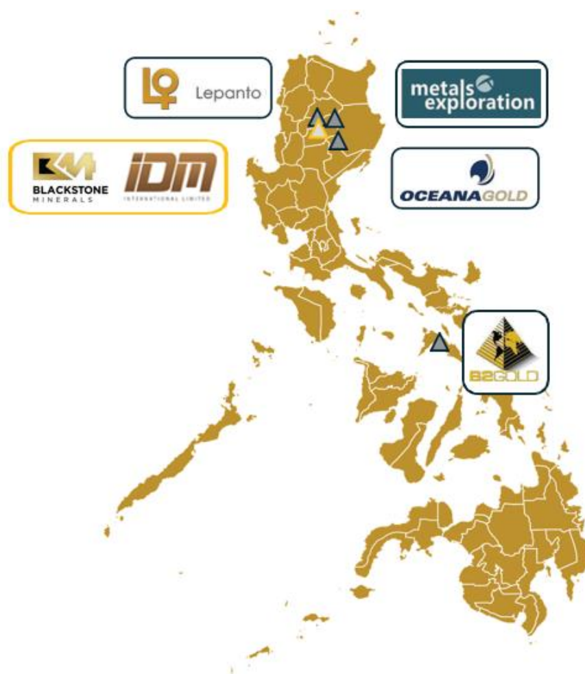
Figure 3 Philippines Mining Operations

Mankayan benefits from its location in the Philippines, a nation with a pro-mining regulatory environment and a long-standing history of successful mining operations (e.g., B2 Gold, OceanaGold). Importantly, the IDM team has materially progressed its social license to operate in Mankayan, ensuring positive relationships with local stakeholders. The Philippines' openness to mining operations, combined with a skilled workforce and existing infrastructure, provides a strong foundation for the project's development.