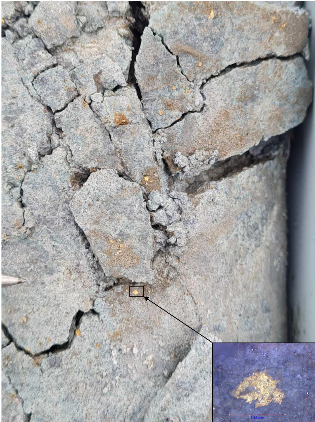
Figure 2 Visible gold identified in diamond drill hole. Drill core has not been sampled or sent for assay. (CDH-62)

To watch a video summary of the announcement click here